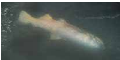
A 31-inch Coho carcass was discovered in Upper Johnson Creek this fall.