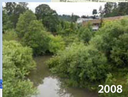
Restoration projects such as this along the banks of lower Johnson Creek on ODS Companies' campus in Milwaukie are included in the Restoration Project Census. Each mapped project includes a link to a detailed description of restoration activities, funding sources, lessons learned, and more.