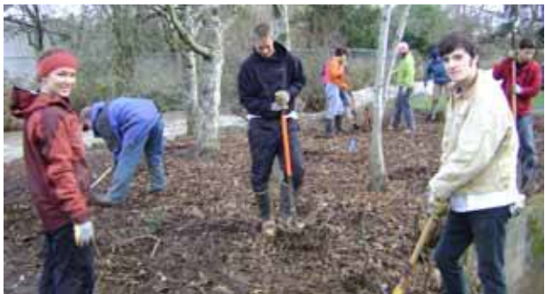
Over 40 volunteers planted 500 trees at Mill Park on Johnson Creek in observance of MLK Day of Service.

The working group has developed a strategy and timeline for designing and implementing these habitat and environmental education elements, and recently submitted a funding proposal to support engineered design of the fish habitat features mentioned above. We look forward to keeping you informed of our progress on this exciting project.